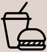
Food & Beverages

Halal Trade, Logistics and Manufacturing Expo will further strengthen Africa's position as a global halal hub and put forward the economic values of Halal for the world.